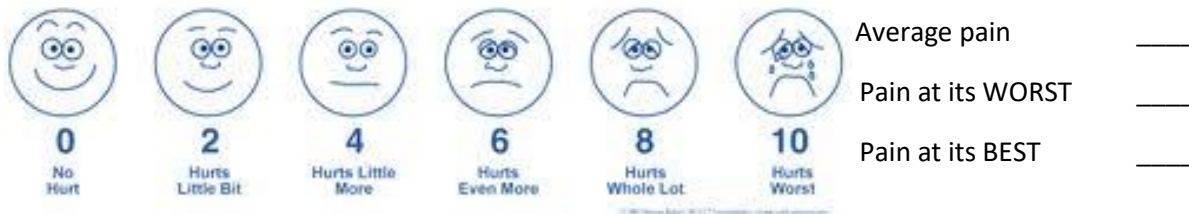
Wong-Baker FACES™ Pain Rating Scale

Mark the painful area on the body diagram: